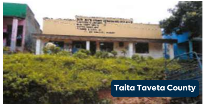
Taita Taveta County