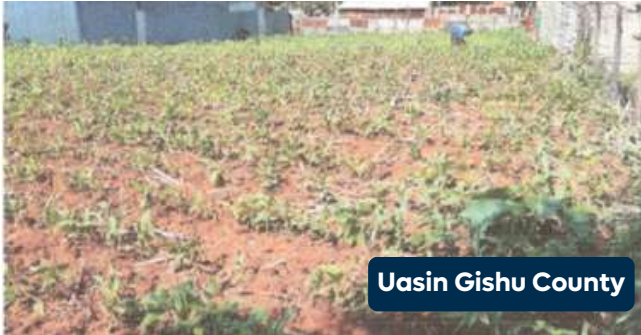
Uasin Gishu County

KCB PROPERTIES FOR SALE (VER. MAY 28052025)