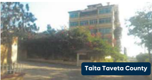
Taita Taveta County