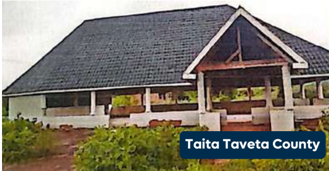
Taita Taveta County